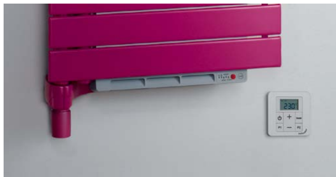
Electric heating fan with timer function and infrared control device