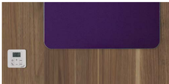
Electric operation version with remote control device.

H = height, L = length, L B = towel rail length