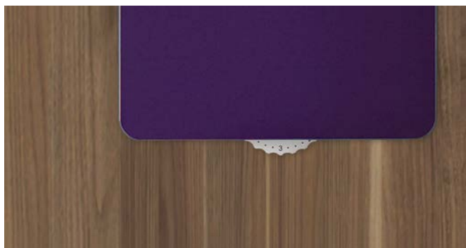
Hot water operation version with concealed Zehnder EasyFit connection box, including adjustment dial.